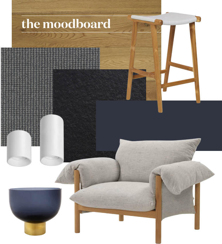
CLOCKWISE FROM STOOL Flat Leather bar stool in Teak, $490, Fenton & Fenton. Albedor flat-profile Holly-edge cabinetry in Antrazite, POA, through Gravina Cabinets and Interiors. Wilfred upholstered American Natural Oak armchair in Seaspray, from $5092, Jordan. Luxor large glass vase in Indigo Blue, $90, Greenhouse Interiors. Titanium surface-mount powdercoated-aluminium lights in UV Textured White, $160 and $184, Lights Lights Lights. Wayfarer wool carpet in Bruce, $68 per sq m, Carpet Court. Smoked oak flooring , $93.50 per sq m, Royal Oak Floors. Zimbabwe leather-finish granite tile , POA, CDK Stone.