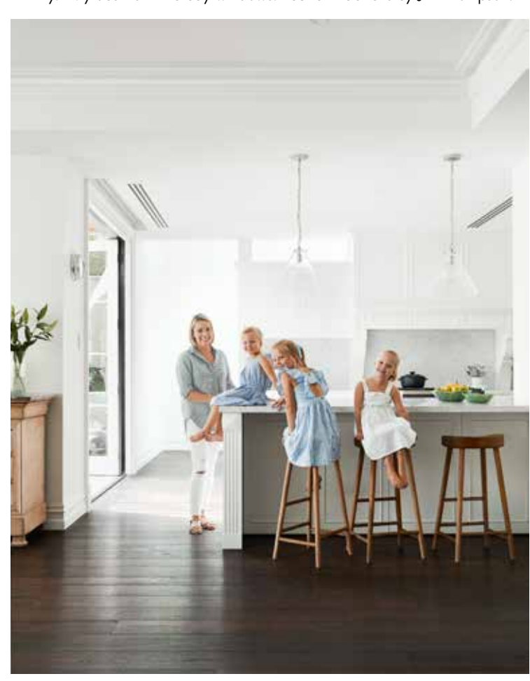
Amy and daughters in the kitchen. "The renovation took 18 months and the garden and landscaping another year after that." Stools are by OKA London.