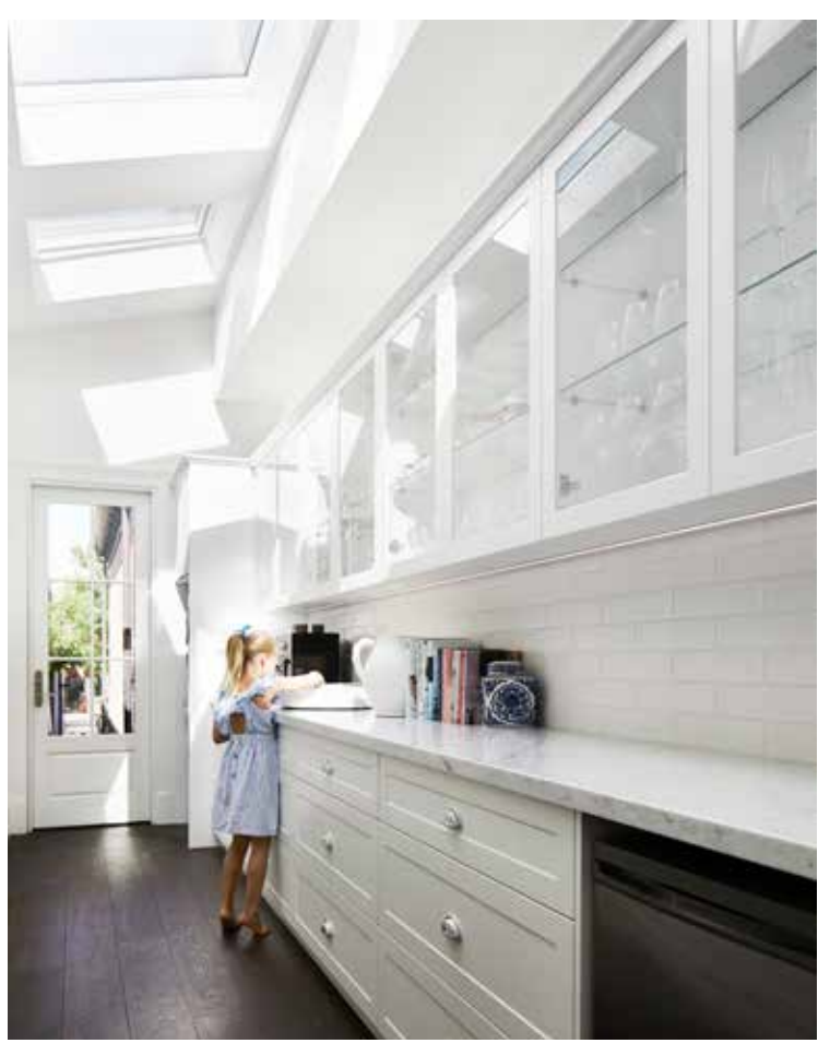
Daughter Olivia gets busy in the well-equipped butler's pantry adjoining the large, light-drenched kitchen that the family loves.