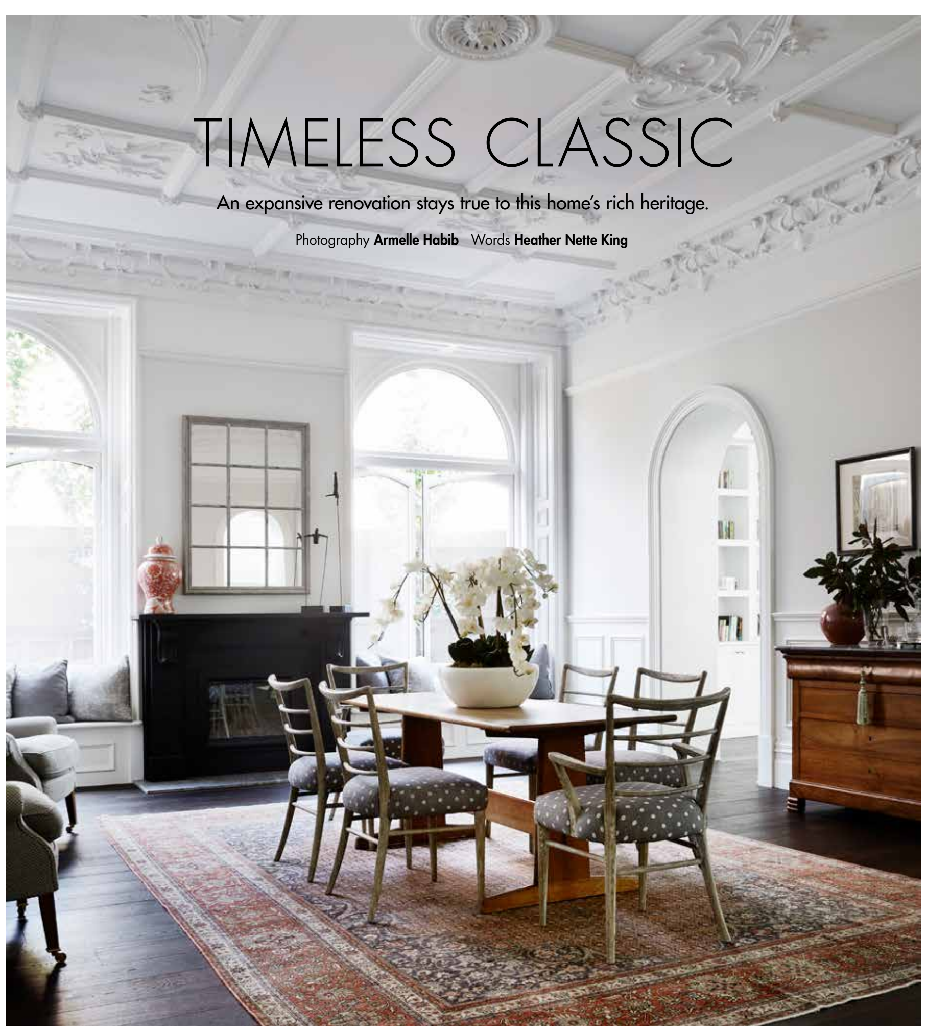
"The house was built in 1884 and this dining room was added in 1901," says Amy. "We restored the ornate ceiling during our renovation." The rug is from Cadrys.