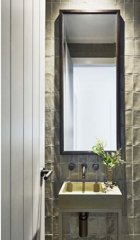
Lighting Co. The separate WC (above) off the wet area has a concrete washbasin on a steel stand in powdercoated Dulux Cove by KWD & Co.