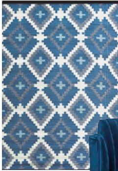
TEMPLE & WEBSTER rug, from $34.95 (120 x 170cm), templeandwebster. com.au