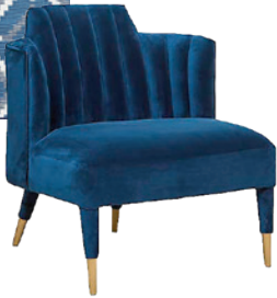
GLOBEWEST chair, $1605, globewest.com.au